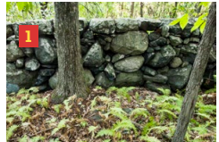
1 Discover great examples of classic New England stone walls.