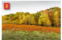
3 Explore Central field, a reminder of our farming history.