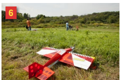
6 Watch the Burlington Flyers fly model planes, weekends & holidays.