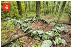
4 Ponder an historic cow compound in Whispering Hill Woods.