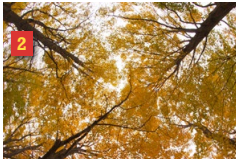
2 Savor a mature forest canopy in the deep woods.